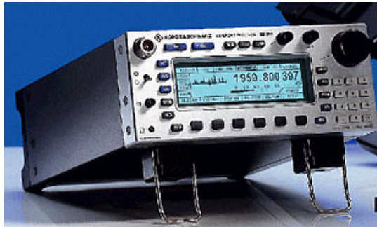
Rhode & Schwarz EB200

It's not too early to start writing Santa to inform him what's on your holiday wish list! I'm wondering how we missed these?