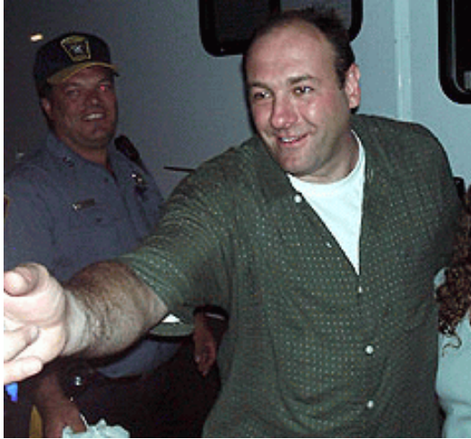
James Gandolfine - a.k.a "Tony Soprano"